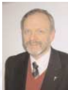
Prof. R.A. Blankenstein

A ctuality, optimal input of the national societies and presentation of a substantial number of communications by junior colleagues: these are the features of the scientific programme of Euromedlab 2007. High quality free communications selected as oral presentations will allow the event to achieve the maximum actuality.