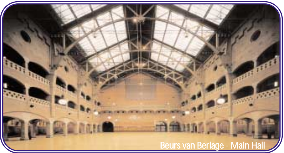
Beurs van Berlage - Main Hall